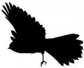
Figure 3. Fantail vector (McMillan, 2009)