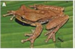
Figure 2. Male holotype of Hypsiboas gladiator (Kohler et al., 2010, p. 584).